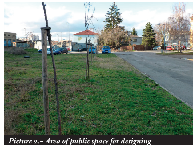
Picture 2.- Area of public space for designing

Ecological view is very important aspect in the designing of development architecture. And how the creative artistic activities fits into this topic? We can see connections between artistic quality and ecology. Environment with great artistic and visual value are more sustainable and has many ecological added values. I can tell that my first contact with the problems of ecology came naturally from a complex and balanced interaction between science and art. So, that is architecture.